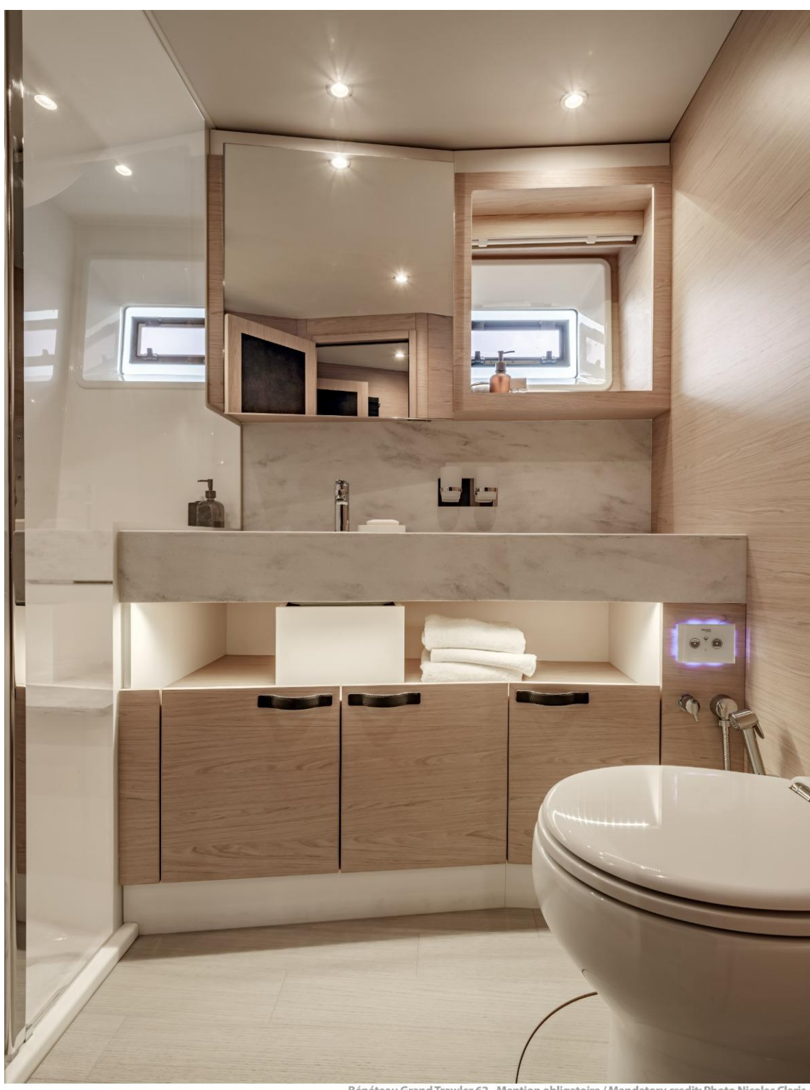
Bénéteau Grand Trawler 62